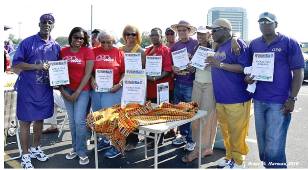
Omega Psi Phi Fraternity, Newark Chapter with AKA's, Delta's and other friends help SCANJ in outreach for sickle cell disease

“SCANJ equals faith with good works for sickle cell disease.”