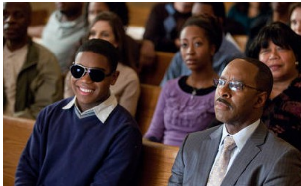
Actors Dexter Darden and Courtney Vance in a scene from the movie A Joyful Noise!

SCANJ's Stellar Evening on The Kente Carpet at the AMC Movie Theatre February 11th.