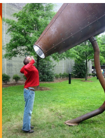
Volume 4 Issue 6

For updates, or to register call 973 482-9070 SCANJ programs are listed on sicklecellnewjersey.org and www.eventbrite.com