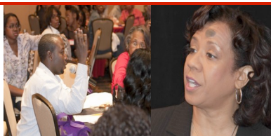
Empowerment Day May 7th

Please email sicklecellanj@gmail.com or call 973 482-9070 to RSVP for the Community Leader's 24 Seven Introductory Meeting, or to learn more. We welcome and need the support of the entire community to make this a success.