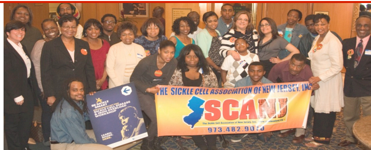
Empowerment Day May 7th Newark Hilton

That was the question posed to me by one of our volunteers as we were preparing for the upcoming Sickle Cellabration. I had just shared the news that we got clearance from the London, England office of Guinness World Records to attempt to set a new world record. What's even more notable is that what we proposed had never been attempted before so they opened up a whole new category to accommodate our request.