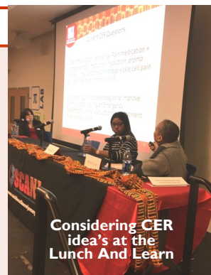
Considering CER idea's at the Lunch And Learn