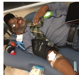
SCANJ Board President is productive at the blood drive