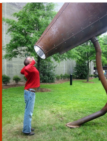
Volume 7 Issue 8

"Break The Sickle Cycle" Sickle Cell Disease Association of America