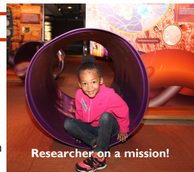
Researcher on a mission!