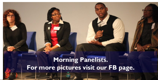
Morning Panelists. For more pictures visit our FB page.