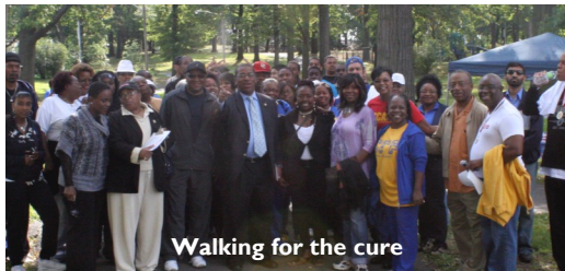
Walking for the cure

best matches come from people of the same ethnic group.