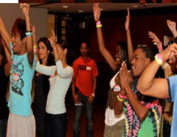
Say It Loud! About Sickle Cell Disease