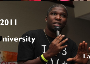
Laugh a Thon