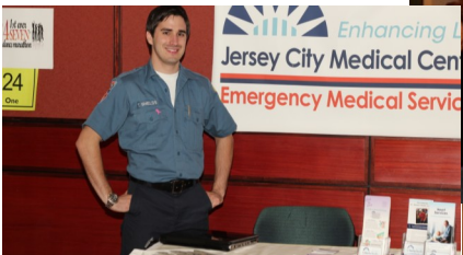
Enhancing Jersey City Medical Center Emergency Medical Services