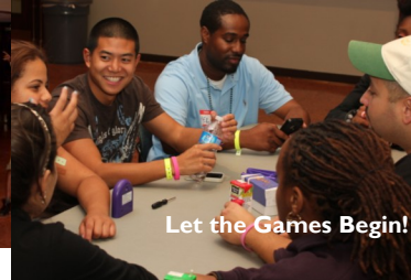
Let the Games Begin!