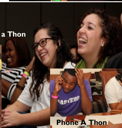
Phone A Thon