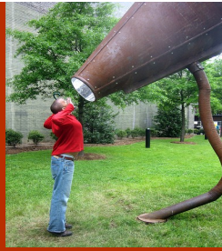
Volume 2 Issue 11