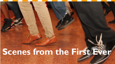
Scenes from the First Event