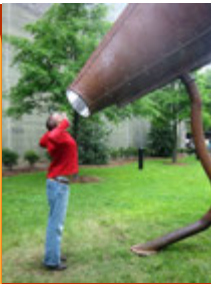
Volume 9 Issue 3

Sickle Cell Disease Association of America