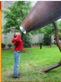
Volume 9 Issue 9

Sickle Cell Disease Association of America