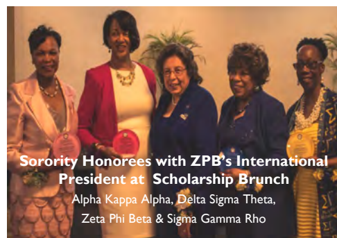
Sorority Honorees with ZPB's International President at Scholarship Brunch

To advocate for and enhance our membership's ability to improve the quality of health, life and services for individuals, families and communities affected by sickle cell disease and related conditions, while promoting the search for a cure for all people in the world with sickle cell disease.