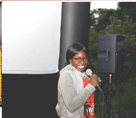
SCANJ thanks Newark's Barnabas Health for funding support for Movie Night.