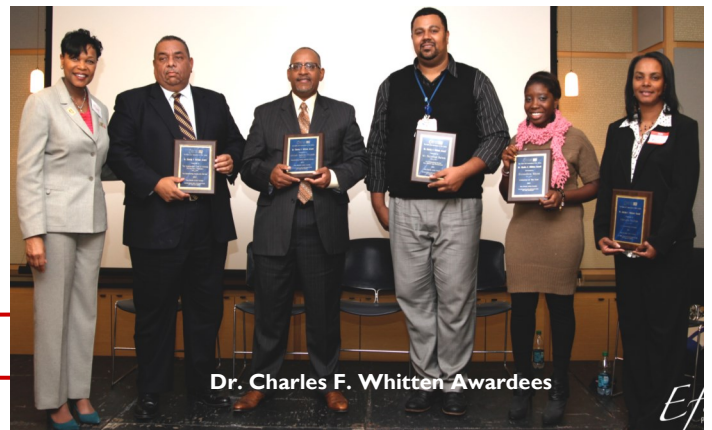
Dr. Charles F. Whitten Awardees